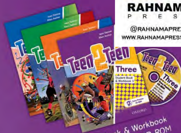
Student Book & Workbook with Extra Practice CD-ROM