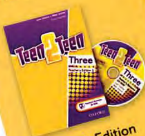
Teacher's Edition with Teacher's Resource CD-ROM