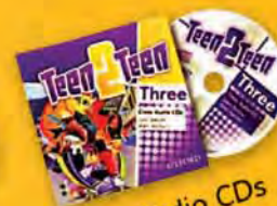
Class Audio CDs