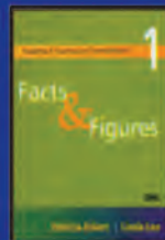
Facts & Figures 1-4130-0445-8

Discover the entire Reading & Vocabulary Development series