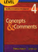
Concepts & Comments 1-4130-0448-2