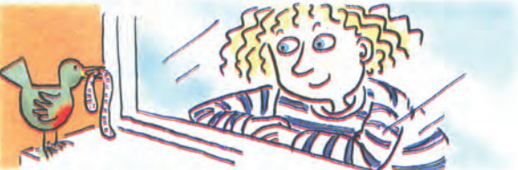
3 Jenny I wouldn't like to eat a worm