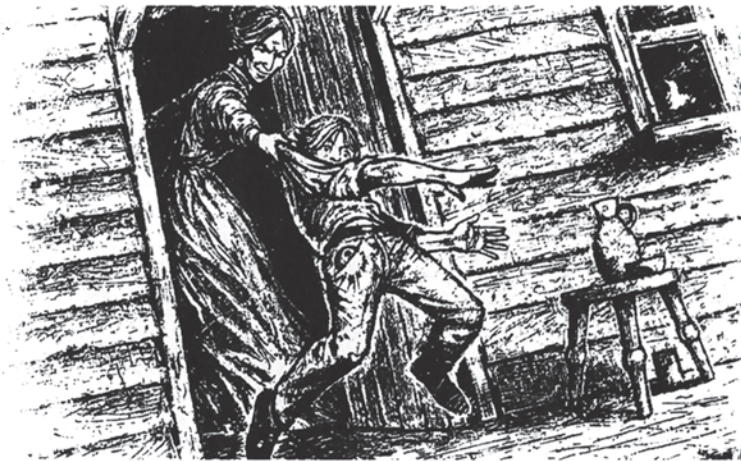
Aunt Polly put out her hand and stopped him.