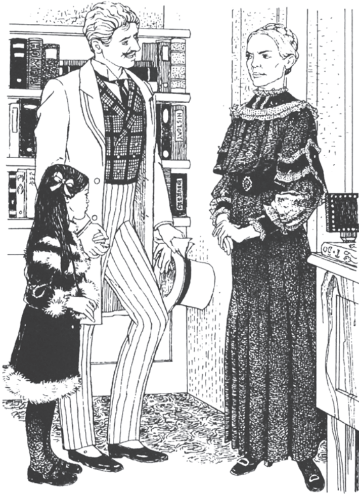
Miss Minchin was a tall woman in a black dress.

‘Her mother was French, so she speaks French well. She loves books, and she reads all the time. But she must play with the other girls and make new friends, too.’