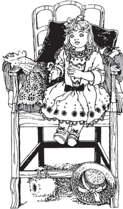
It was a big, beautiful doll.

She was very good at telling stories. She was a clever child, and the other girls loved to listen to her. The