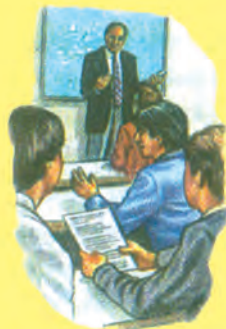
. . . a student? No, . . . . . . . a teacher? Yes, . . . .