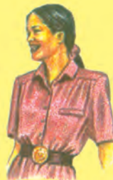
Is she a teacher? No, she isn't. Is she a student? Yes, she is.