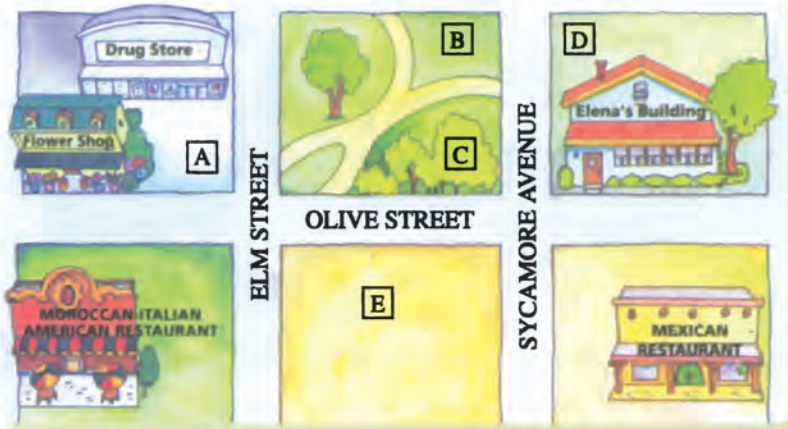
▲ Elena's neighborhood