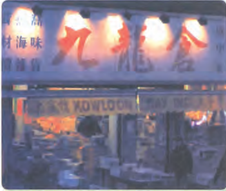
▲ A neighborhood store in California