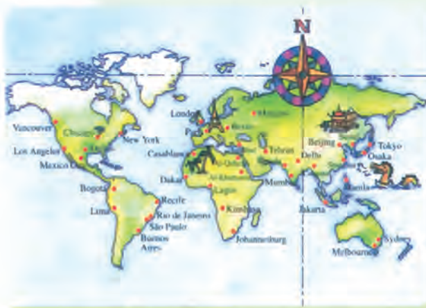
▲ Map of megacities