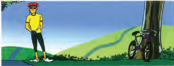
He 's going to go cycling.

break the window break the world record build a snowman go cycling play tennis